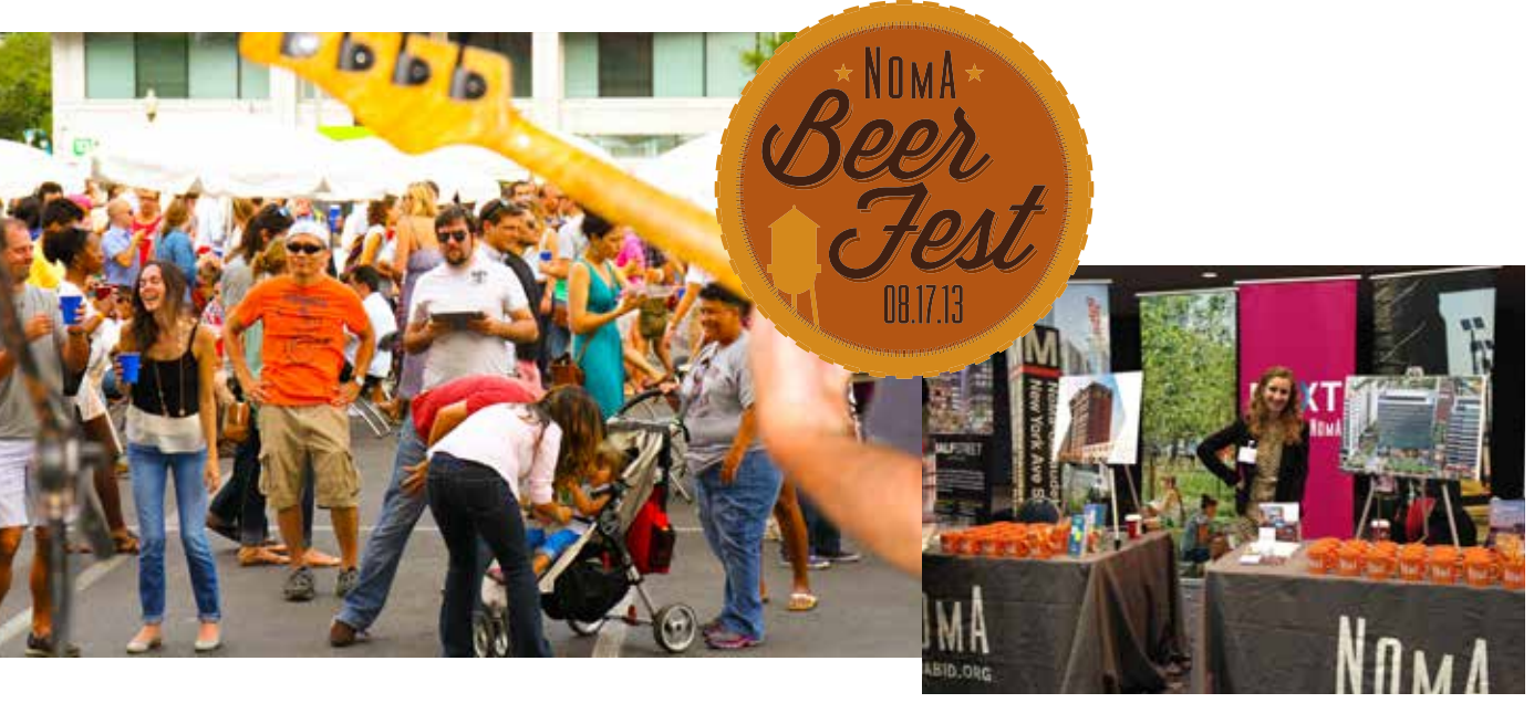
L: NoMa Beer Fest featured local beer and was held on two parking lots owned by The JBG Companies. R: NoMa BID collaborated with members to sponsor the WDCEP development showcase.

The NoMa marketing team expanded their reach in 2013.