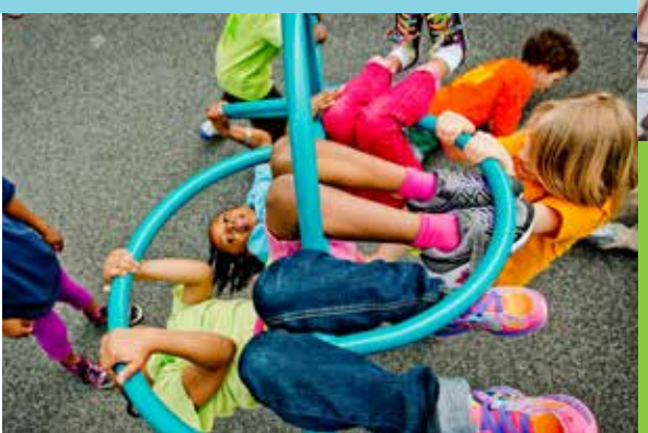
Above: Children playing at Two Rivers Public Charter School playground. R: Preliminary drawings of a public plaza at L Street, NE.

for NoMa parks & public spaces from DC government