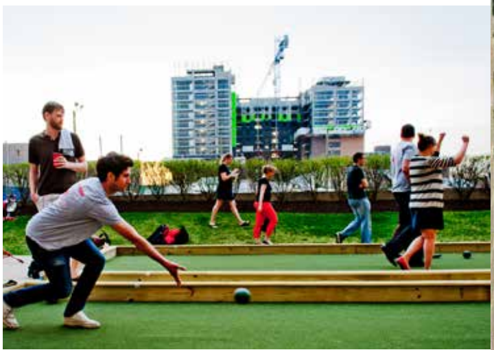
Above: DC Bocce behind 1200 First Street, NE. R: First Sreet, NE before construction started.